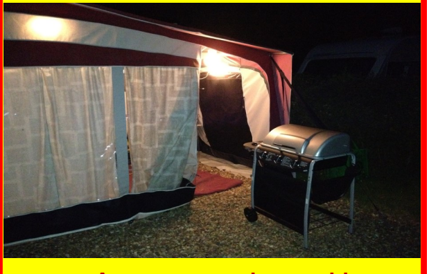
A caravan awning could start you yawning!